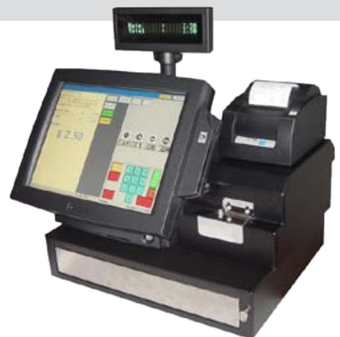
Sample ticket dispenser, validation encoder and bar code valet fee computer